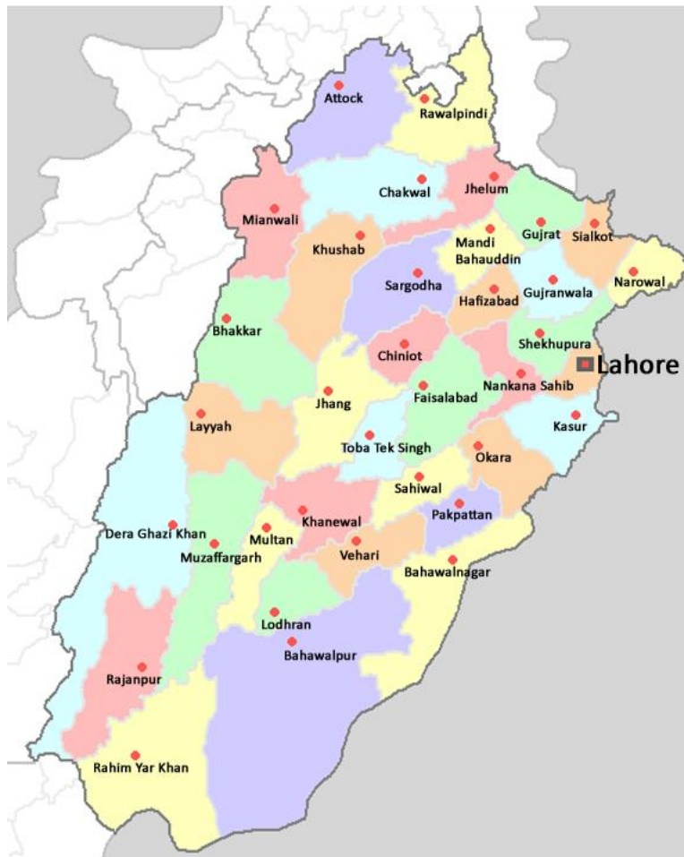
Figure 1. Map of the Punjab, Pakistan, showing the districts of the province.

Sheikhupura is one of 36 districts of the province of the Punjab and is adjacent to the district of Lahore in the northeast of Pakistan, as shown in Figure 1 (1). Its boundaries run extensively along the boundaries of Gujranwala and Nankana Sahib, and a small limit of Narowal. According to the 2017 census, updated in 2018, Sheikhupura has a population of 3,460,426, with 2,258,636 representing the rural and 1,201,790, the urban population, making it a rural to an urban ratio of 1.87 to 1 (2). This shows that Sheikhupura is predominantly a rural expanse (65%). However, no further information is available about its population structure.